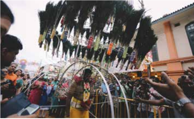
Crowds along the procession route cheering for a kavadi bearer