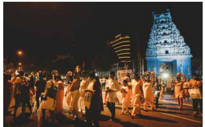
One of the first few batches of devotees carrying paalkudam leaving Sri Srinivasa Perumal Temple for Sri Thendayuthapani Temple