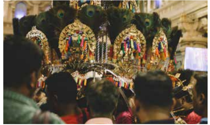
A kavadi bearer finally reaches his destination – Sri Thendayuthapani Temple