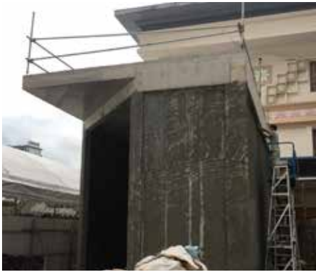
New home for the silver chariot under construction

Though Vastu started out with the construction rules for Hindu temples, it soon branched out to cover residential houses, office buildings, vehicles, sculpture, paintings and even what kind of furniture to buy for the home, office and Temple rooms, how to place the conference table in a meeting room and where the leader of an organisation should sit to conduct meetings.