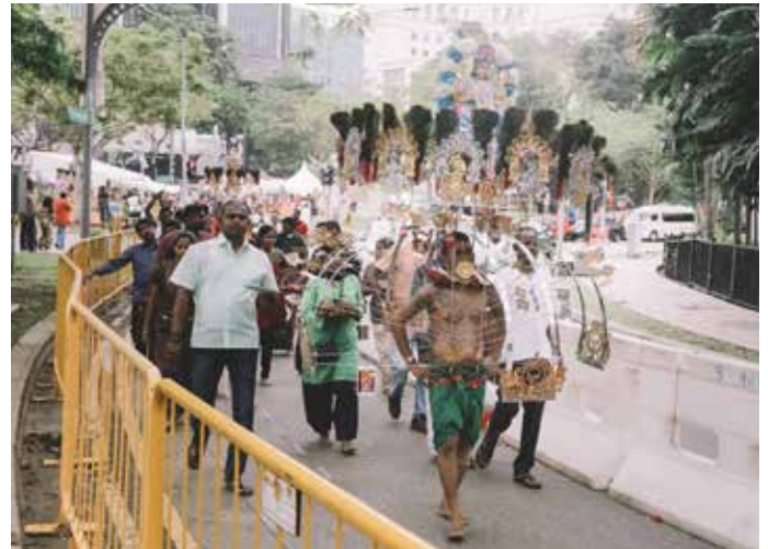
A kavadi bearer along Penang Road – most of the AM kavadi bearers had a smooth walk to Sri Thendayuthapani Temple