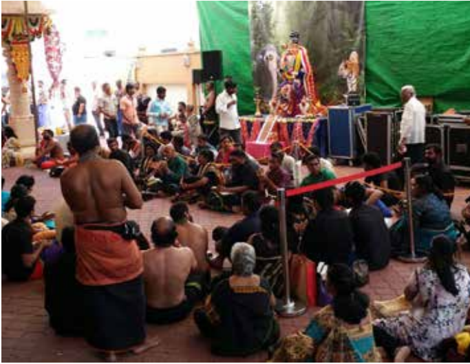
Devotees singing bhajans as part of Makara Vilakku celebrations at the Temple