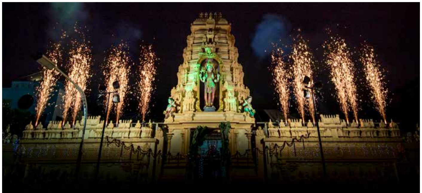
Special pyrotechnics to mark the 50th Anniversary of Makara Vilakku celebrations on 14 January 2017