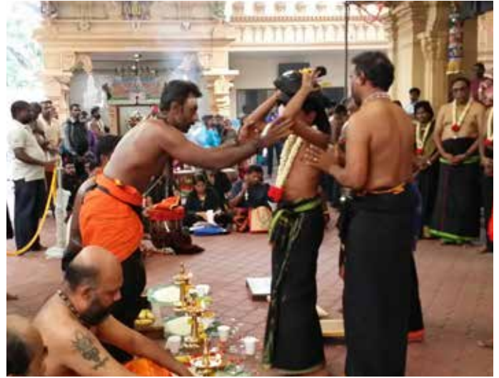
Devotees carrying the Irumudi as part of Makara Vilakku prayers