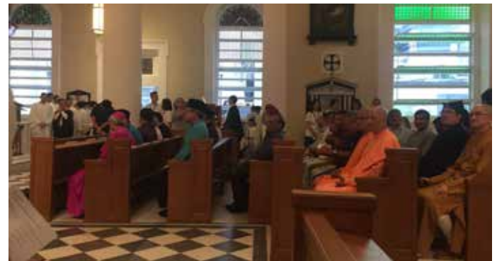
Members of the various interfaith groups at the Archdiocesan Interreligious Christmas celebration held on 29 December 2016 at Cathedral of the Good Shepherd