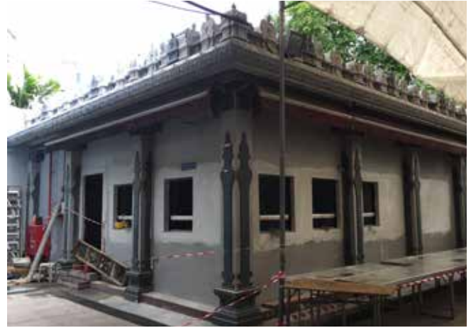
Works on-going for the Temple office to make it more user-friendly

The traditions and Pooja procedures at Sri Srinivasa Perumal Temple are steeped in Vaikhaanasa Agama principles and it is every intention of the Temple's Management to improve on the way poojas and ubayams are done with the help of top Vaishnava scholars.