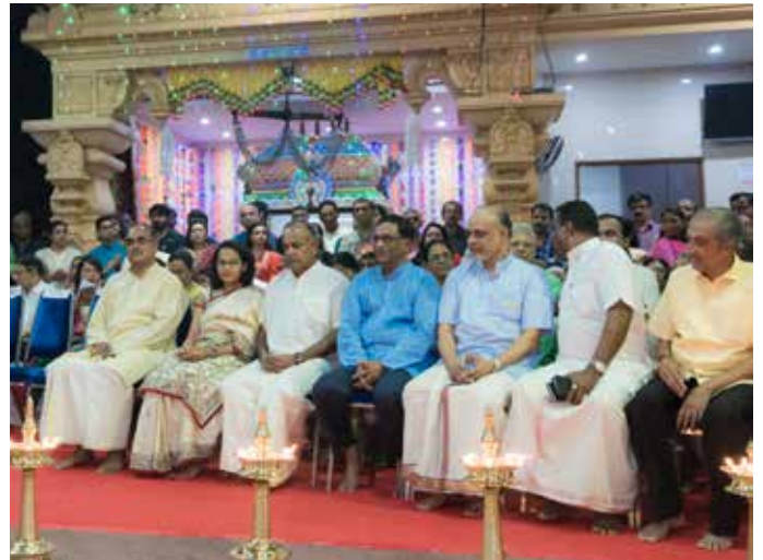
Special guest Mr K Shanmugam, Minister for Law and Home Affairs (seated, third from left) at the event