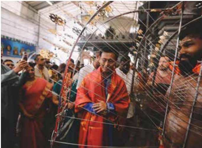
Guest of Honour, Education Minister (Higher Education and Skills) Ong Ye Kung (in red shawl), interacting with kavadi bearers in Sri Srinivasa Perumal Temple