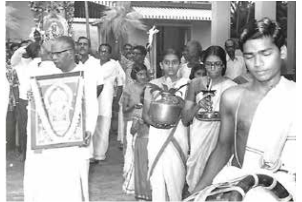
Makara Vilakku celebrations in 1973