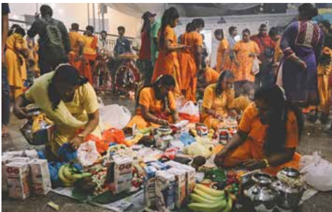
Devotees preparing their paalkudams in the early hours on Thaipusam day

T haipusam is an annual Hindu festival celebrated in honour of Lord Murugan. Thaipusam was observed on 9 February this year. Around 50,000 participants and observers gathered for the Festival which stretched from Serangoon Road to Tank Road. Hindu News brings you the highlights of the Festival in pictures.