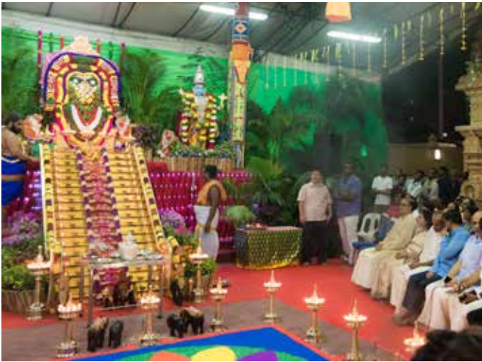
Prayers for Sri Ayyappan at Sri Vairavimada Kaliyamman Temple on 14 January 2017