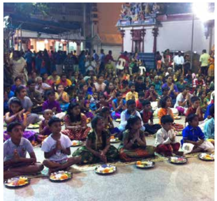
Children performing a prayer to seek the blessings of Sri Saraswathy (Goddess of Knowledge) at Sri Mariamman Temple on 8 January 2017