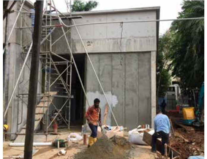
The new Temple kitchen under construction

Hindu News looks forward to a much refreshed Sri Srinivasa Perumal Temple and will bring you regular updates on the Temple's redevelopment works progress in our subsequent issues in 2017.