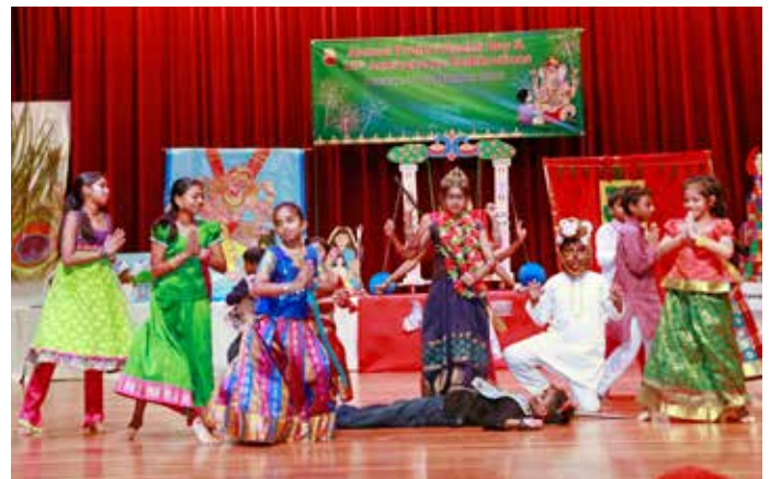
A performance by children during the finale segment