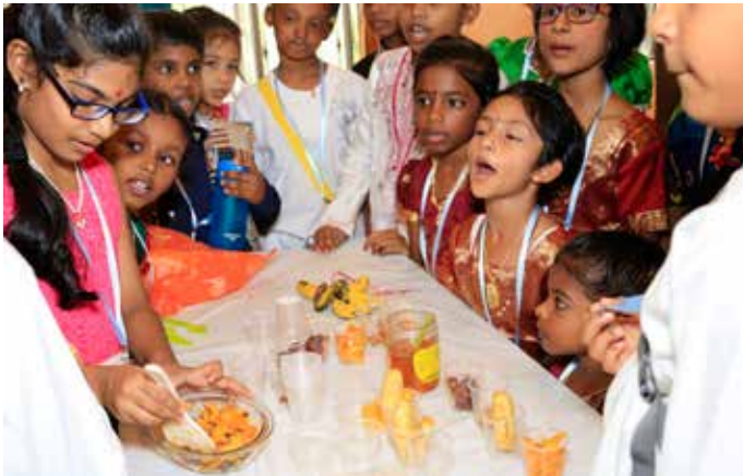
Children learning to make Panchamritam